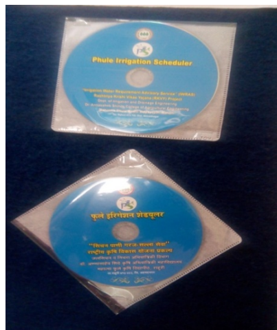
CD's of Phule Irrigation Scheduler

Therefore, this project has developed desktop application called 'Phule Irrigation Scheduler' wherein the users can know the volume of water to be applied and time of operations of specific irrigation system. In this application the crop coefficient values and other details are provided as default data set. However users can change like Phule Jal. Phule Irrigation Scheduler desktop application has also converted into mobile app wherein farmers has to register farm, crop, soil, irrigation system and its other details, based on which mobile app estimate the how much water need to be applied and time of operation of irrigation system. Both the