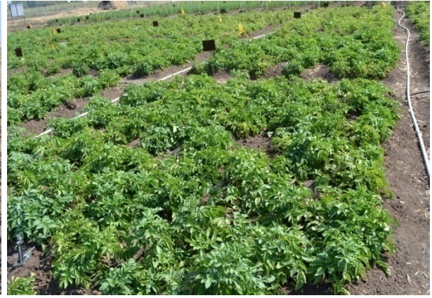
Potato experimental plot