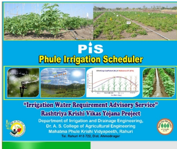
Phule Irrigation Scheduler (English) Desktop application