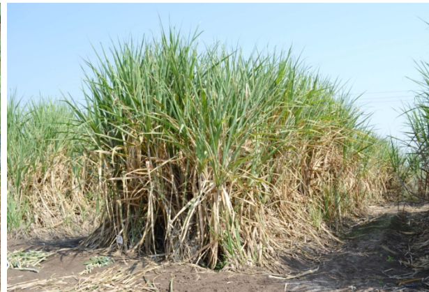
Sugarcane experimental plot