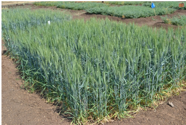
Wheat experimental plot