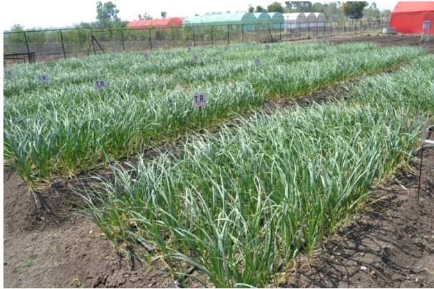
Onion experimental plot