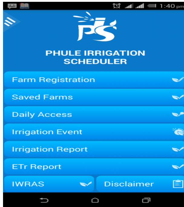
Phule Irrigation Scheduler Mobile App