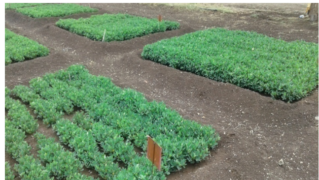
Ground nut experimental plot