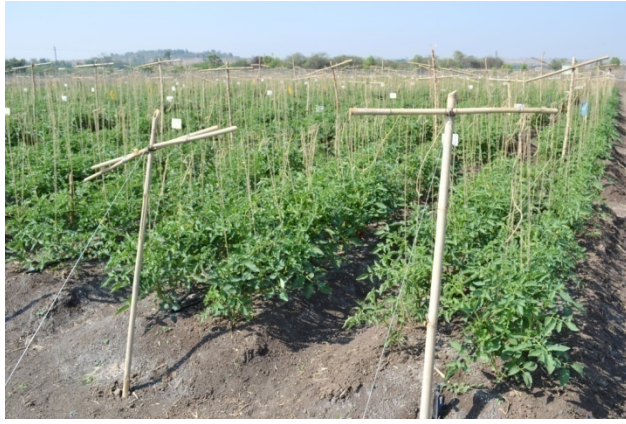
Tomato experimental plot