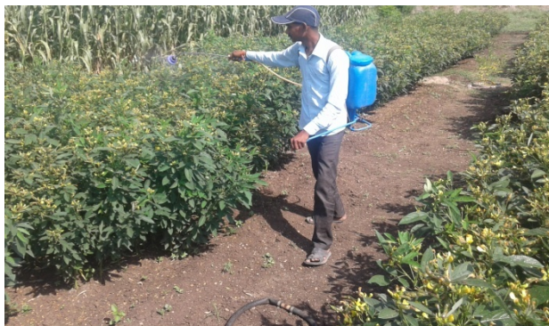
Peagion pea experimental plot