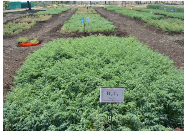
Gram experimental plot